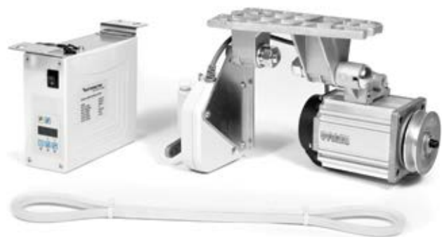
TEXI POWER 750 S