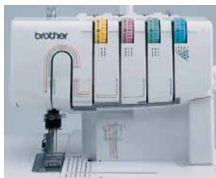
Easy to follow lay-in threading and Colour-coded threading guide