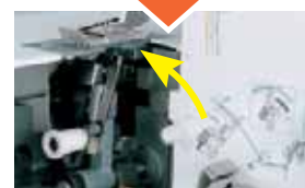
Fast and easy looper threading system